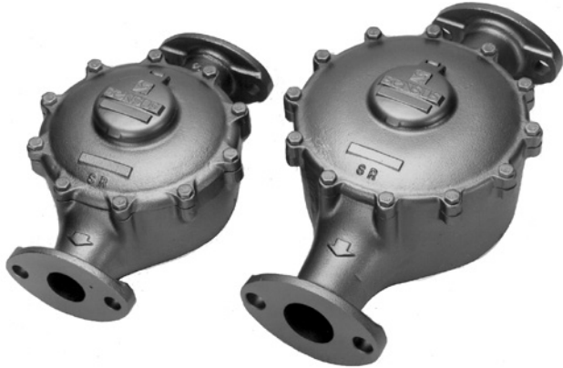
1-1/2" SR ® (DN 40mm)

Maintenance: Sensus Sealed Register Water Meters are engineered to provide long-term value and virtually maintenance-free operation because of their design simplicity and interchangeability of modules. Sensus SR